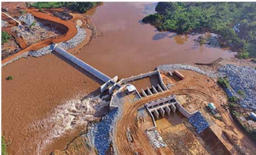
↑ The company is a leading expert in water management in the country