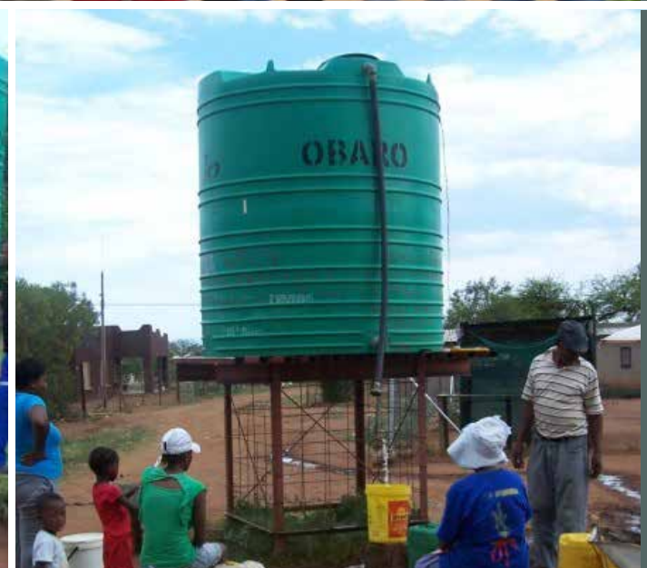
Community members of Ledig, collecting water on a daily basis from the water tankers set up at strategic places within the community