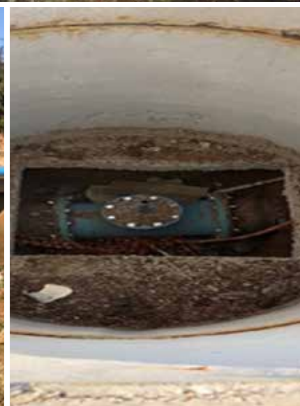
Construction of the bulk water infrastructure that will attempt to provide long term water solutions to water shortages in Ledig