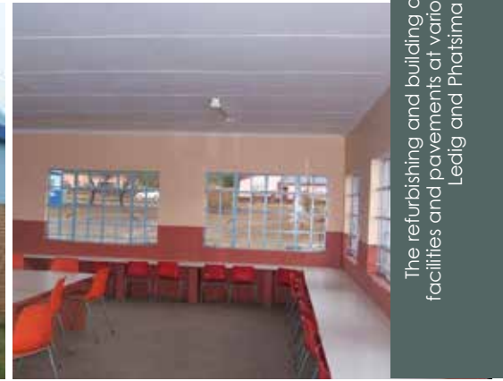
The refurbishing and building of ablution facilities and pavements at various schools in Ledig and Phatsima