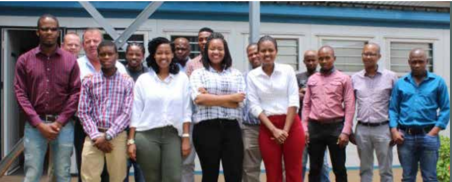
Participants of the Human resource development projects from our host community Ledig