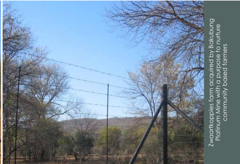
Zwaartkoppies farm acquired by Bakubung Platinum Mine with a purpose to nurture community based farmers