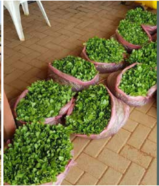
Developed structures and livestock of the Zwaartkoppies farm, as well as crops cultivated by three different co-operatives working at the farm