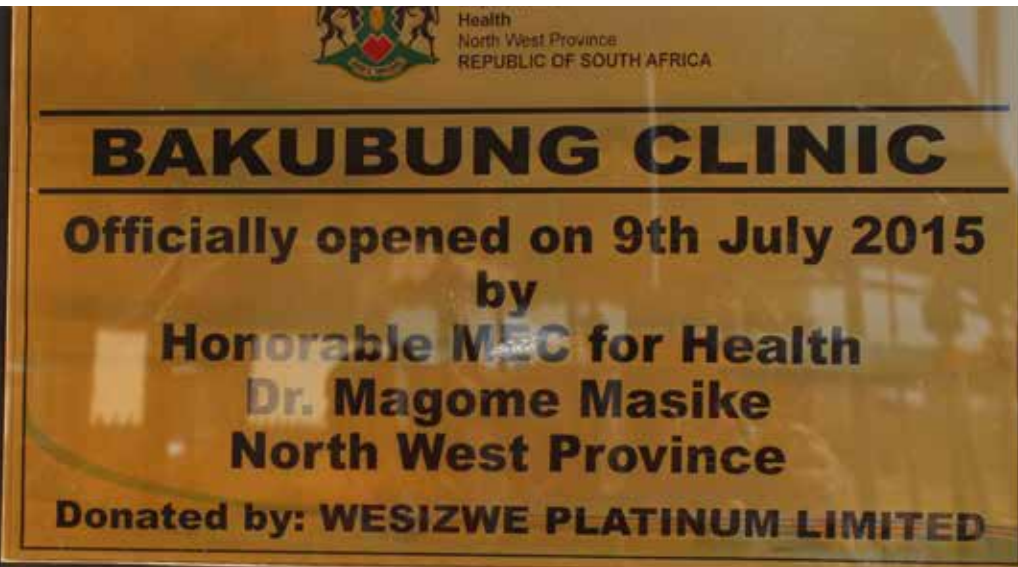
The official plaque which was unveiled during the opening ceremony of the Bakubung Clinic in Lediq