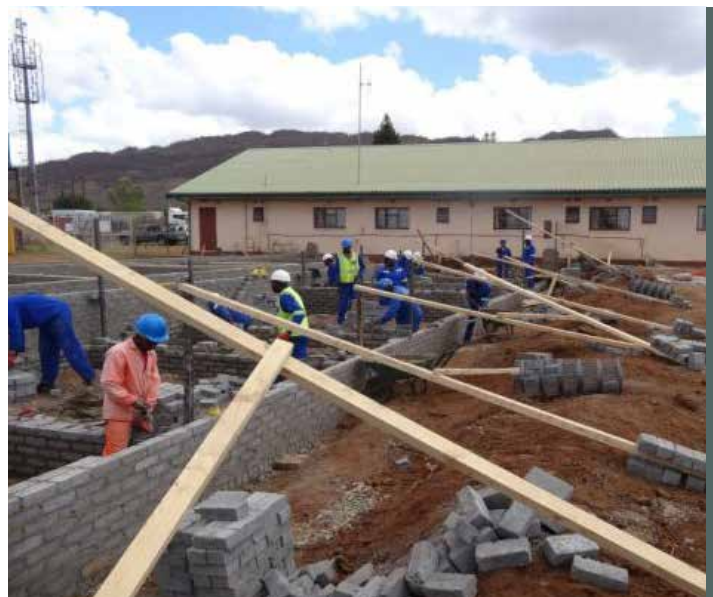
Renovations of the youth centre. The centre is primarily utilised for youth skill development focusing on health awareness and life skills